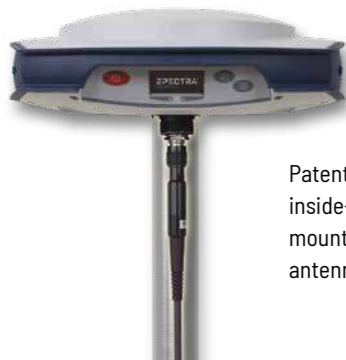
Patented inside-the-rod mounted UHF antenna design